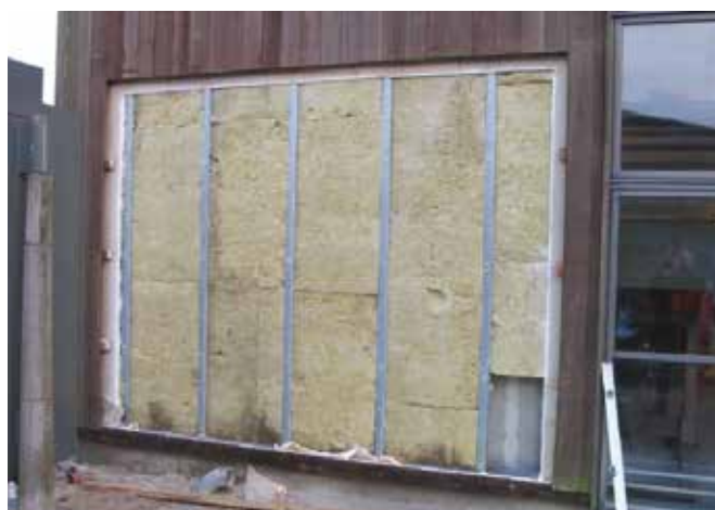
Example from a sample collection documentation: wall element

The energy-saving power of mineral wool insulation is as strong as the day it was installed — even after 55 years of use — according to independent research commissioned by the European Insulation Manufacturers Association (Eurima).