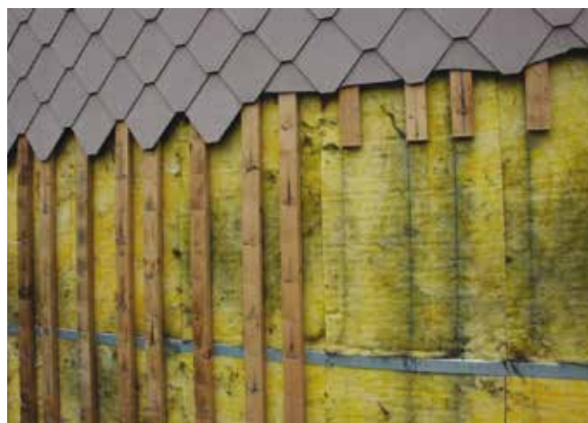
Example from a sample collection documentation: ventilated facade